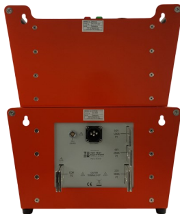
PCU1-SP Mk3 and NLU5000

Where higher currents and powers are required for primary injection, 11kVA and 20kVA primary injection systems are available. The PCU1-SP and PCU2/E systems have separate control and loading units, allowing a wide range of load conditions to be covered with different loading units.