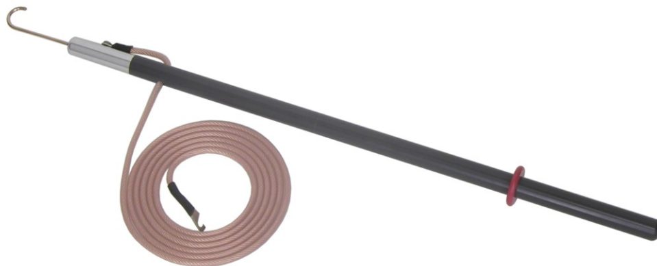
ES30 Earthing stick

An earth terminal is provided on the transformer, which must be connected to a low impedance local earth.